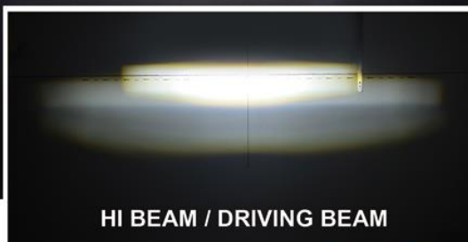
HI BEAM / DRIVING BEAM