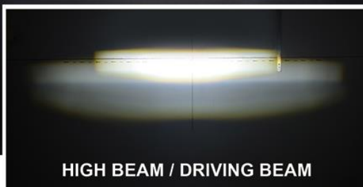
HIGH BEAM / DRIVING BEAM