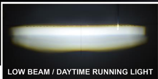
LOW BEAM / DAYTIME RUNNING LIGHT